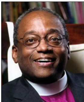
Bishop Michael Curry Bishop of the Diocese of North Carolina

Save the date - Saturday, November 8, 2014 11:00 a.m. Rock Springs Center, Greenville, NC