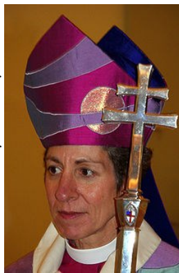
Presiding Bishop Katharine Jefferts Schori

The Rt. Rev. Michael Curry, Bishop of the Diocese of North Carolina, will be the preacher.